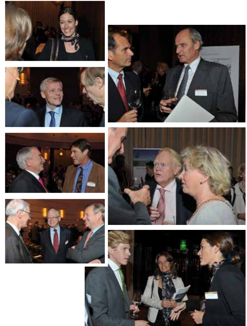
Swedish Swiss Business Forum 4 th November 2010