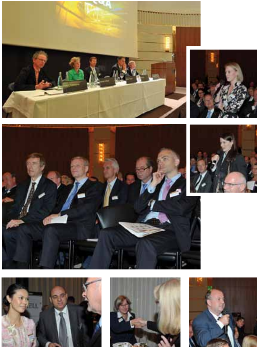
Swedish-Swiss Business Forum, 4 th November 2010